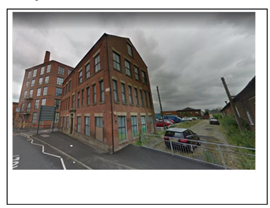
Photo 1 – view of building at 85 Cavendish Street with Cavendish Mill in background

Photo 2 – view of land to the rear of 85 Cavendish Street – this land forms the northern parcel of the application site