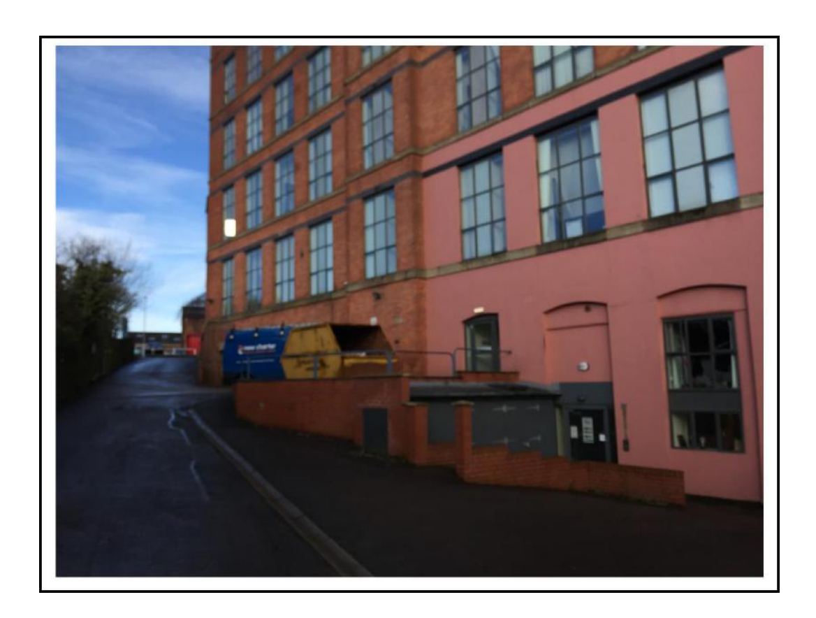
Photo 4 – view of the eastern boundary of the southern parcel of the application site (with Cavendish Mill in the background) from the tow path on the southern edge of the Canal